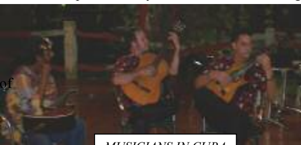
MUSICIANS IN CUBA

There were some amazing testimonies that came out of this tour and there is not enough room to write and I have just chosen very few of the lot. The time in Cuba was amazing one of the divine encounter was I started to share about my life and music to a group of musicians who performed in the resort and they ended up listening to the gospel for about 2 hours and in the end they autographed their CD for me writing, "God bless U" and I was so thrilled to see that writing keeping in mind that it was a communist country. There are so many stories from CUBA but can't mention due to security reasons. In Haiti God gave me the opportunity to minister to the Ministry of Justice and glory to God that about 70 of them listened to Luke 6:43-46 keeping in mind that Haiti is among the top 5 most violent nations.