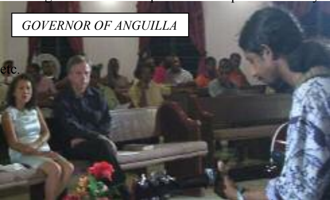
GOVERNOR OF ANGUILLA

.One other challenge was the outward appearance, I purposely had my hair braided so that I could share to the people about the importance of the heart. In some of the countries braided hair for a man meant being feminist or a rastafarian. Most of the places people changed their perspective towards the outward looks but there was one place in Martinique where I was asked not to be the main speaker due to my hair and I challenged them with the little time I had to not judge out the outward appearance. And the other aspect I challenged is to redeem the STEEL PAN as it has been termed as a Worldly Instrument due to it's association with the carnival. But I used my Album – When the Music Fades and talked about redeeming the instruments & culture for God.