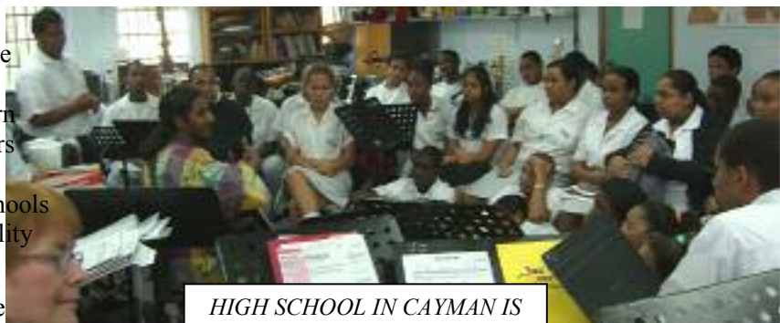
HIGH SCHOOL IN CAYMAN IS

There were some amazing testimonies that came out of this tour and there is not enough room to write and I have just chosen very few of the lot. The time in Cuba was amazing one of the divine encounter was I started to share about my life and music to a group of musicians who performed in the resort and they ended up listening to the gospel for about 2 hours and in the end they autographed their CD for me writing, "God bless U" and I was so thrilled to see that writing keeping in mind that it was a communist country. There are so many stories from CUBA but can't mention due to security reasons. In Haiti God gave me the opportunity to minister to the Ministry of Justice and glory to God that about 70 of them listened to Luke 6:43-46 keeping in mind that Haiti is among the top 5 most violent nations.